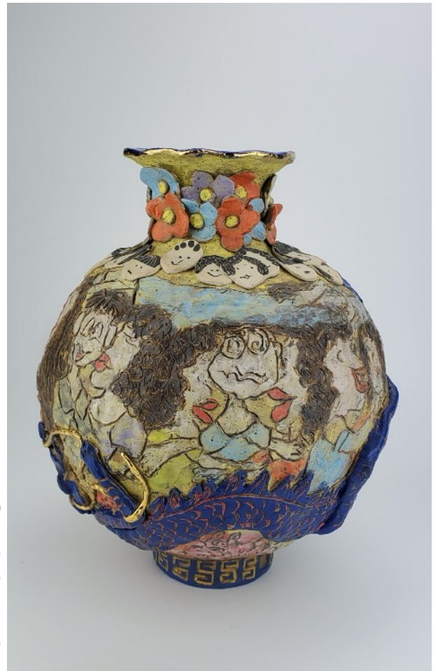
Family Portrait, 2020

Stoneware, handbuilt, coiled and pinched, colored slips, underglazes, sgraffitto, clear glaze, fired to cone 6, luster, cone018 26,6 x 22,8 x 22,8 cm 10.5 x 9 x 9 in. Unique piece