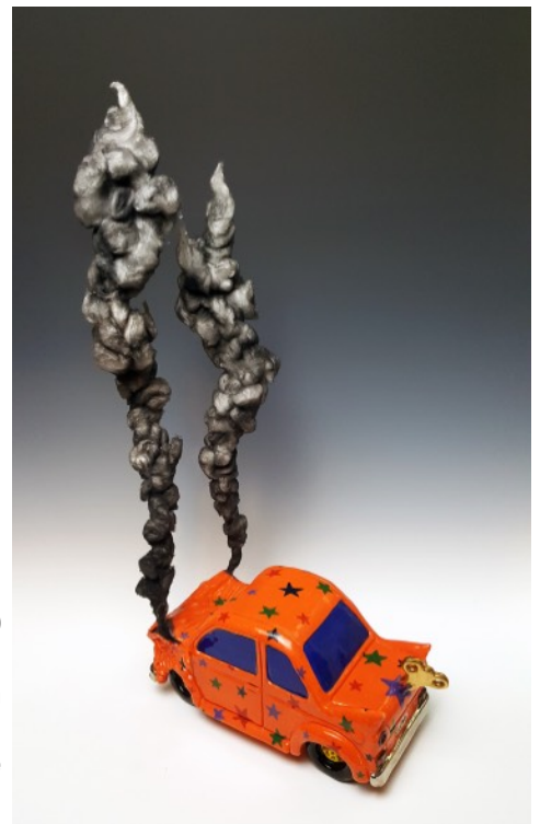
Rest in Peace, 2019