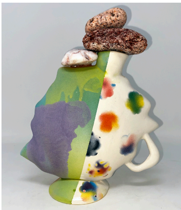
The Vase That looks like a Bus Seat, 2020

Working within a craft that is often approached from a traditionalist point of view, I acknowledge the past as foundational while smiling towards the future, incorporating newer techniques of 3D printing, and contemporary approaches like applying laser printed decals to slipcased or hand-built objects. Clay helps me foster a feeling of glee and acceptance, creating space to connect with these complex and difficult memories in a positive light and move forward. Through my work, I am slowly realizing that the truth and endurance of my memories are less valuable to me than the ability to freely and frequently engage with whatever version of them currently persists. These techniques, when applied to vessels, actualize a process of renewal and reinvention on familiar bodies and forms. In this way, my practice gives me the space to remake and reconsider past histories of craft traditions and past versions of myself.