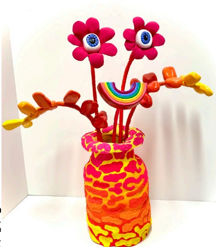
Unblinking Blooms, 2020

2007 Closed Lids, Washburn Gallery, Eugene, OR. 2007 Sleep, Laverne-Krause Gallery, Eugene, OR.