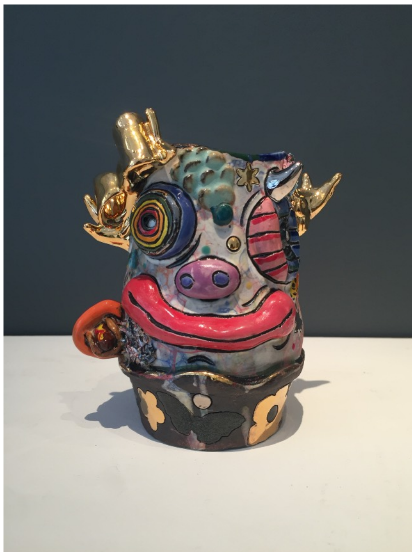
Broogon, 2020 Ceramic glazed 13 x 7 cm 5 x 2.75 in. Unique piece