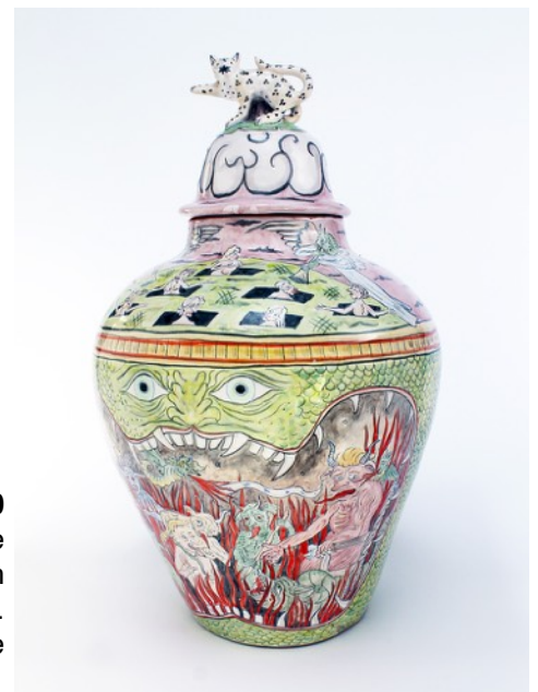
The Kingdom Urn, 2020