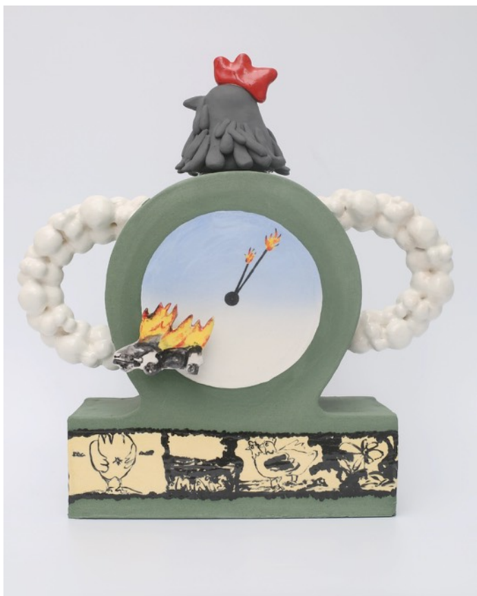
1312CLOCK , 2020 Faïence et mécanisme 33 x 32 x 14 cm 12.9 x 12.5 x 5.5 in. Unique piece