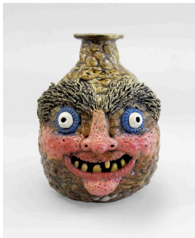
Blush Goatee Jug, 2018