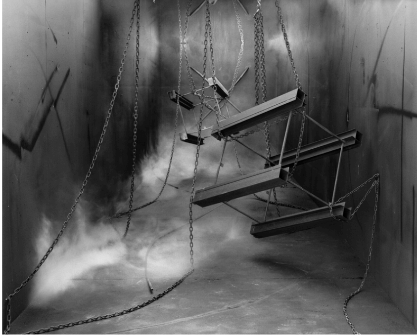
Rodrigo Valenzuela, Afterwork #1 , 2021.

More gather around the gallery's corners, along with a solemn video work and a handful of suspended sculptures that aggregate dark tools like a more cynical Louise Nevelson sculpture. Surrounding the sculptures are photographs evincing, or promising, destruction: landscapes suggest hellish factory floors stocked with pipes and hooks that beckon towards unknown horror. Chains hold the hooks fast. In these 2021 archival inject prints, fog drifts, a tool of bureaucratic obfuscation, a byproduct of overheated creation, or the last ghostly gasp of eliminated employee morale. Hard to see exactly; impossible to miss.